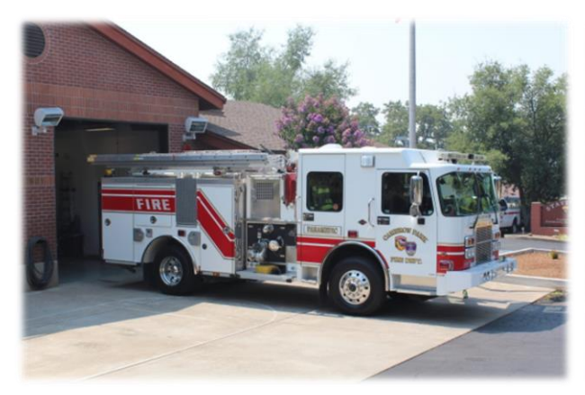
Figure 1: Cameron Park Fire Department Stations

To assist with developing this new First Responder Fee, the Department engaged DTA to develop a cost of services (or user fee) analysis (the "Analysis"). DTA has prepared this Analysis using the Department's operating budget, three years of call data related to medical calls, and operational information provided by staff to determine the fee level that best suits the Department's needs in recovering their expenditures related to providing these services.