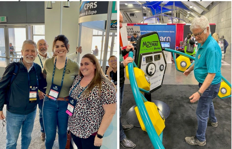
No Board Members were hurt while playing with playground equipment.