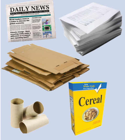
Clean and dry, NO greasy pizza boxes