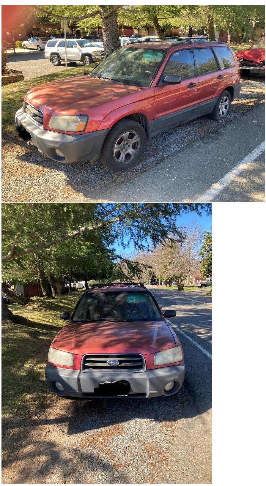
Abandoned vehicle has been removed.