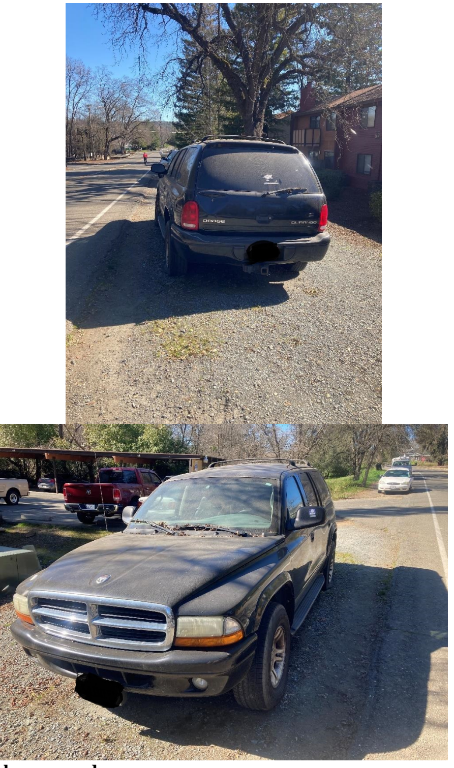
Durango to be removed