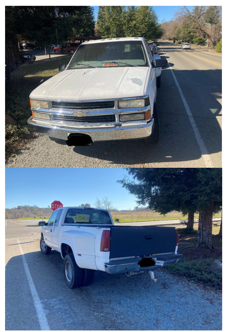
Vehicle for sale. Not much we can do. This is a traffic issue and can possibly be tagged by CHP for parking to close to Stop sign.