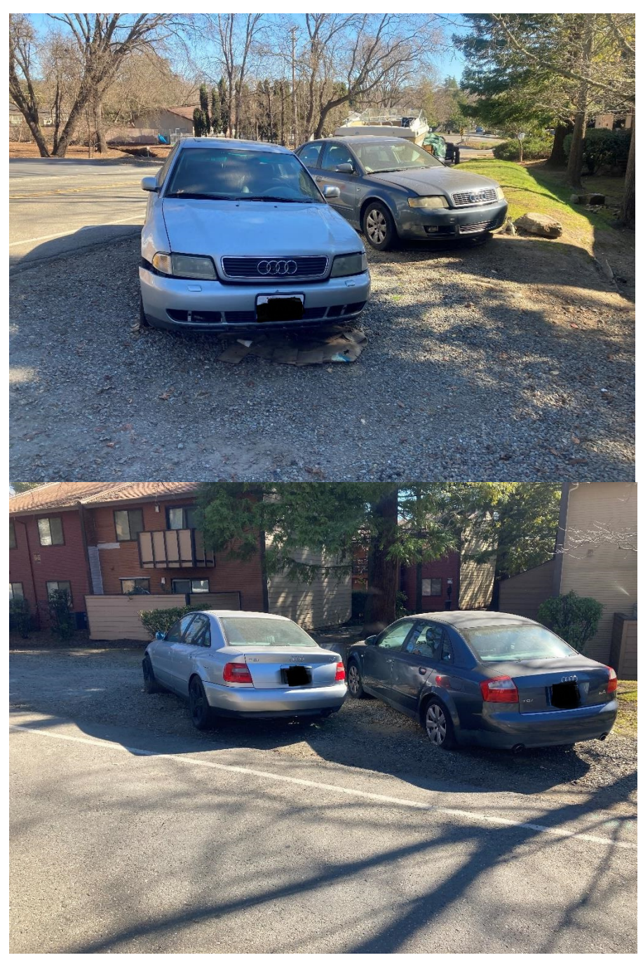
Dark Grey Audi A4 has been removed