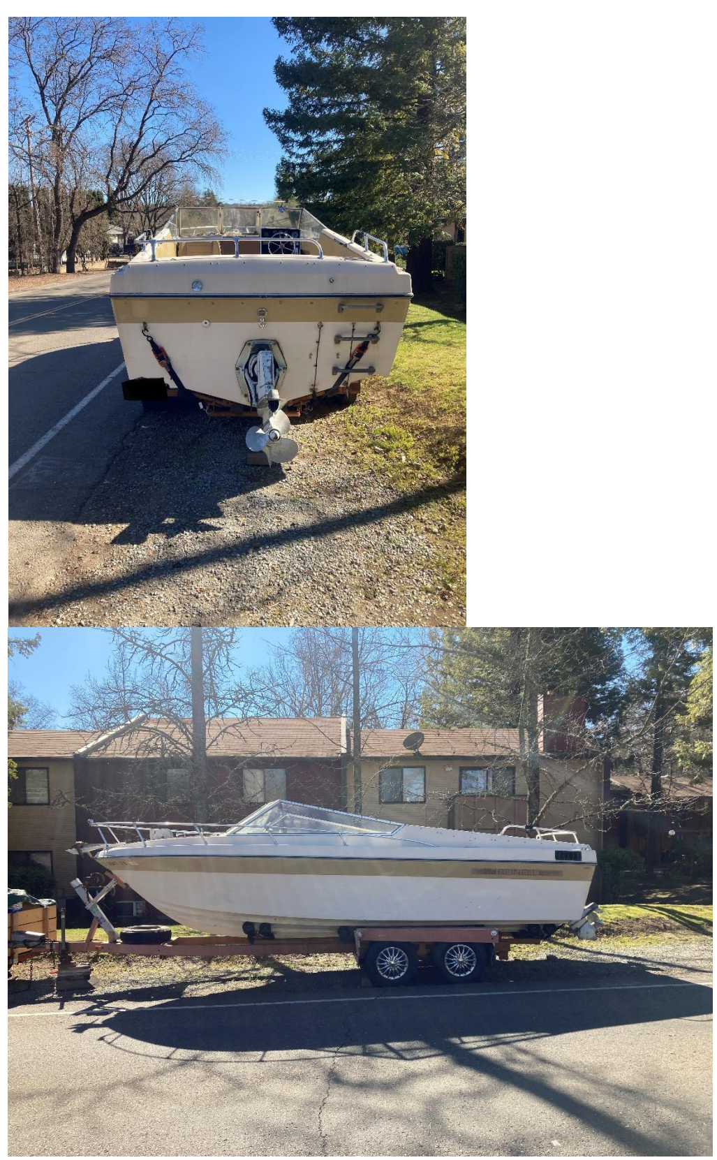
Boat has been removed