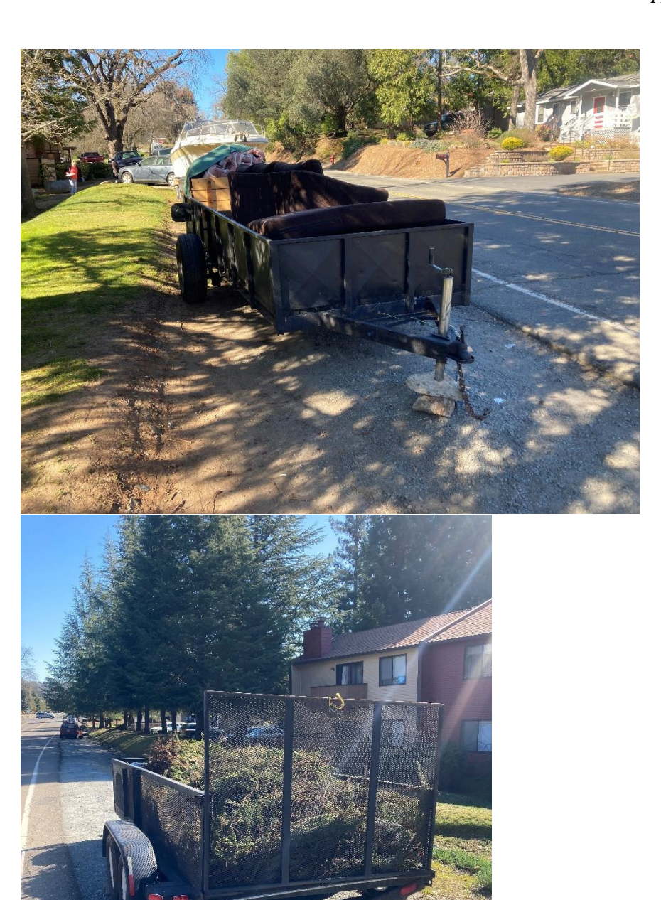
Trailers to be removed