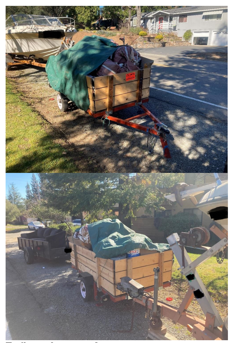
Trailers to be removed