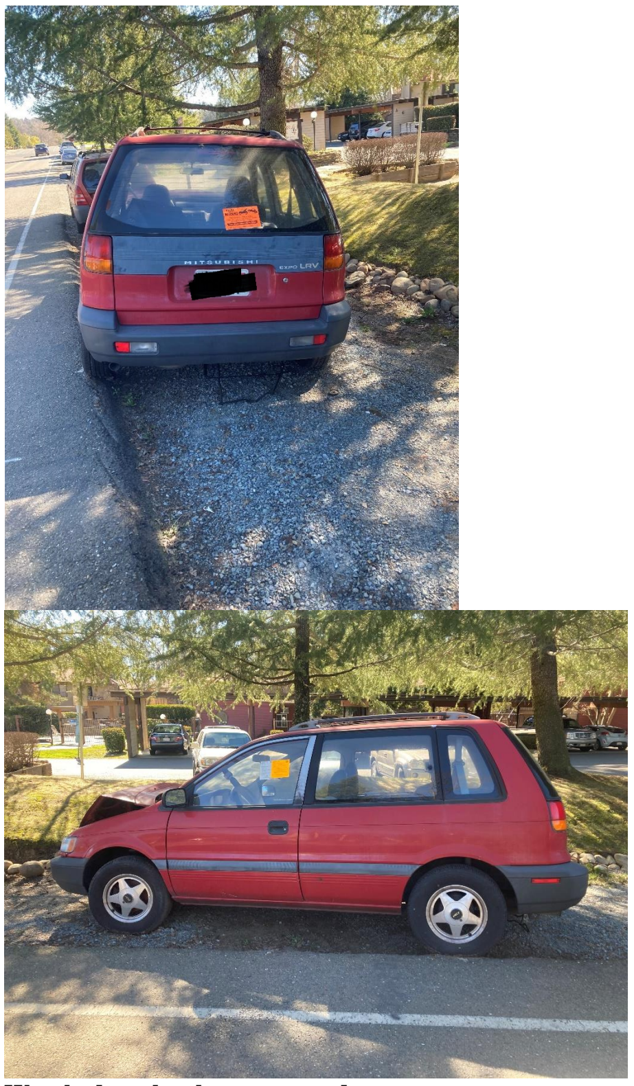
Wrecked car has been removed